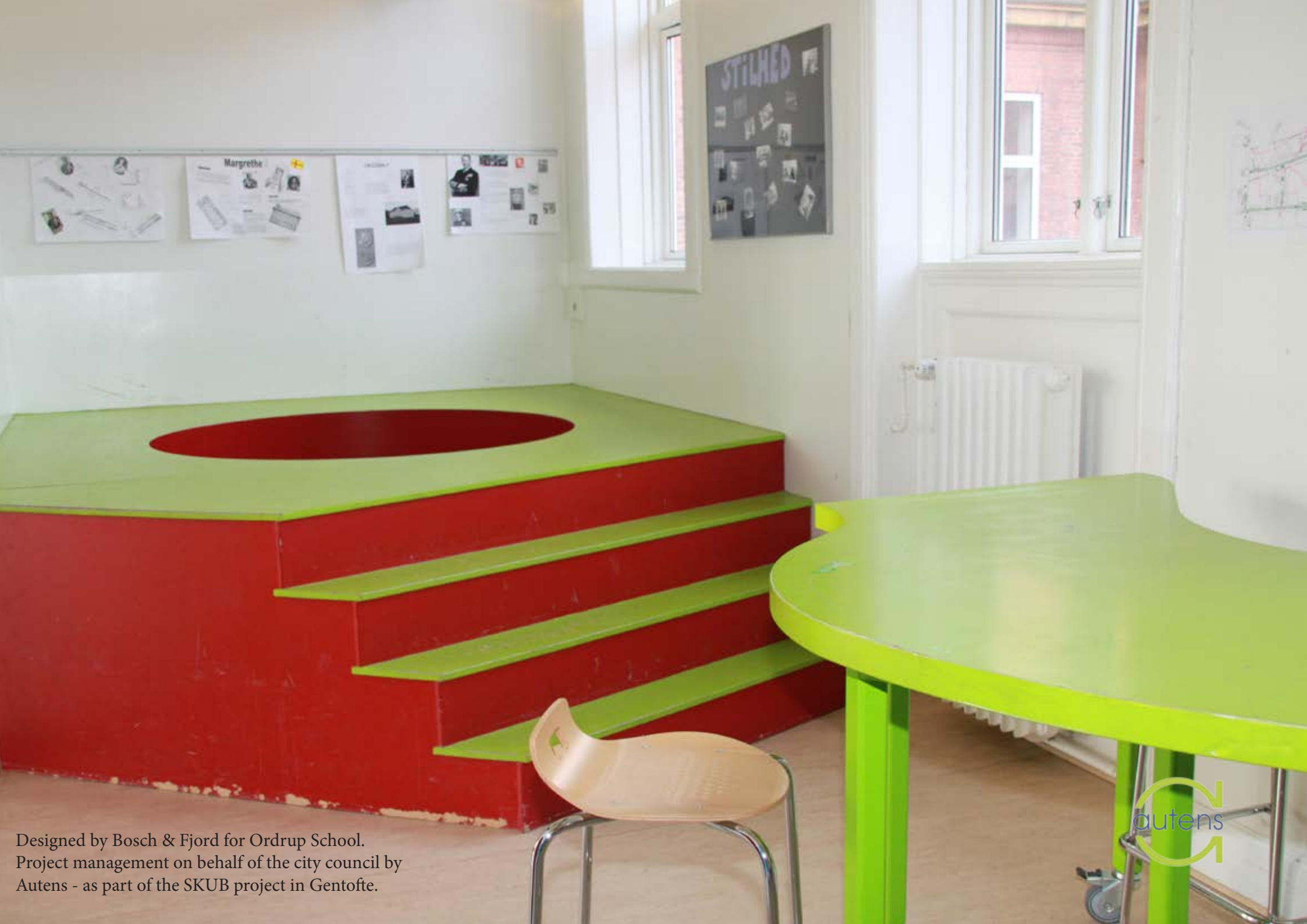
Designed by Bosch & Fjord for Ordrup School. Project management on behalf of the city council by Autens - as part of the SKUB project in Gentofte.