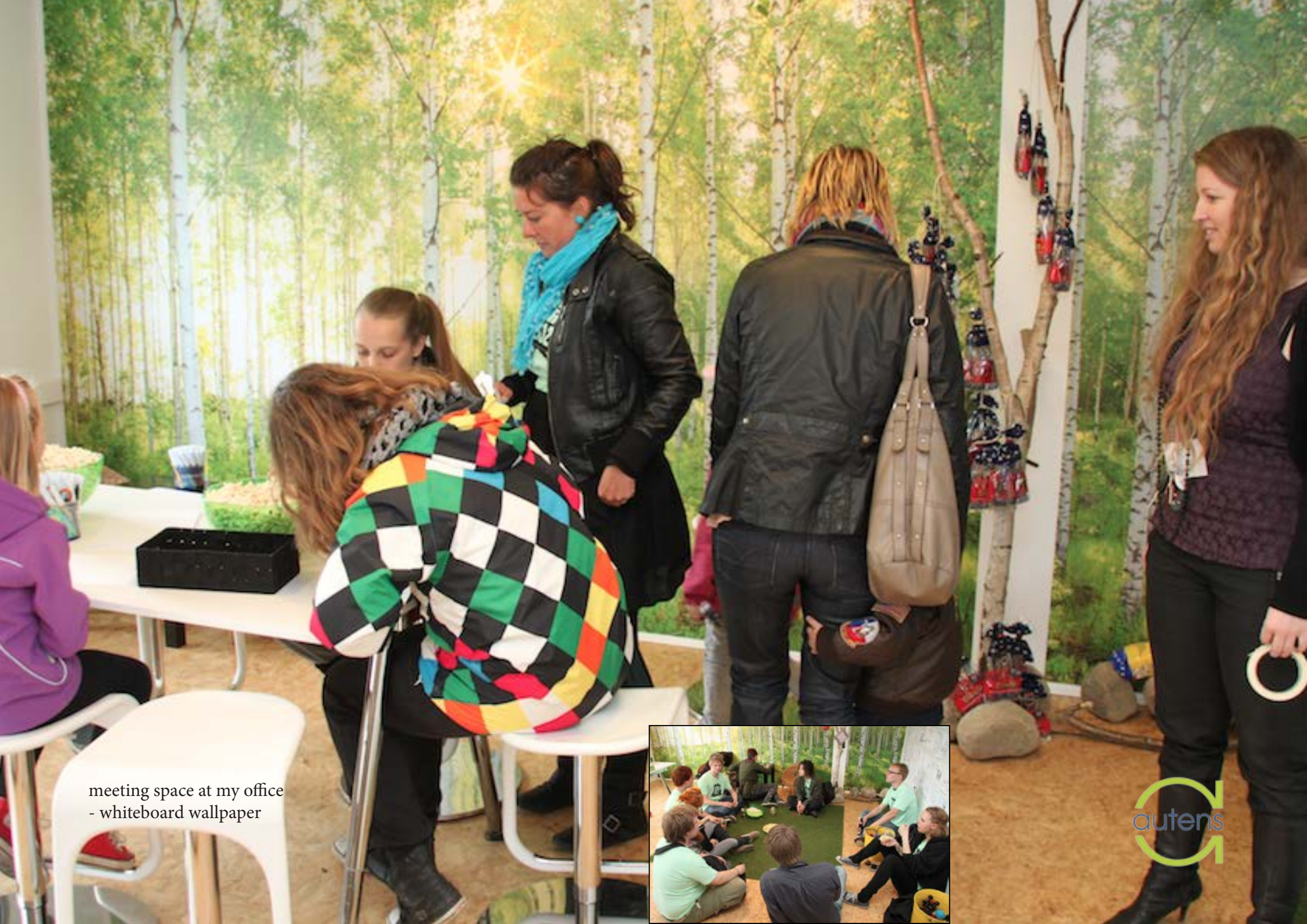
meeting space at my office - whiteboard wallpaper