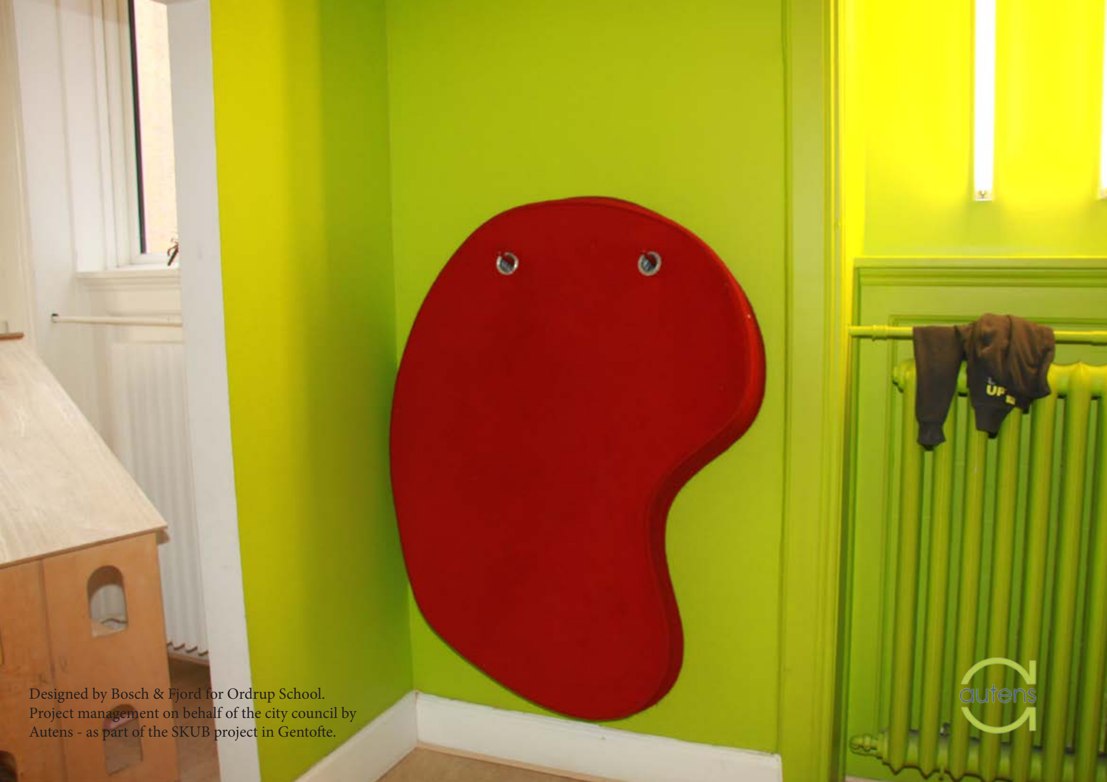
Designed by Bosch & Fjord for Ordrup School. Project management on behalf of the city council by Autens - as part of the SKUB project in Gentofte.